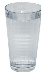
Glass of water