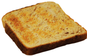
1 slice (30 g) multigrain bread