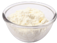
Cottage cheese ½ cup, 120 g

* For more 'Add Ons' serves refer to Appendix 2