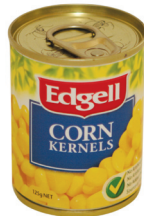
125 g corn