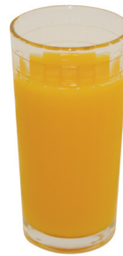
Fruit juice, 200 ml