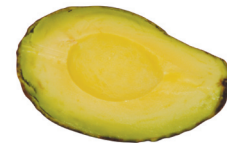
⅓ avocado (60 g)