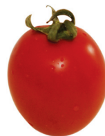
Tomato, 100 g