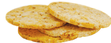
4 grainy corn/rice cakes