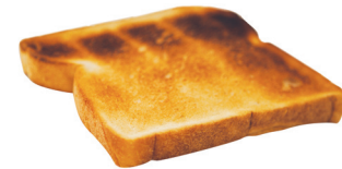
1 slice (30 g) low GI white bread