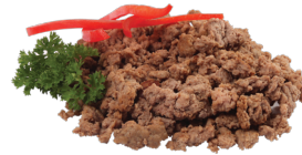
Mince, ¼ cup, 55 g