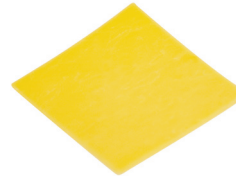
1 slice cheese, 20 g