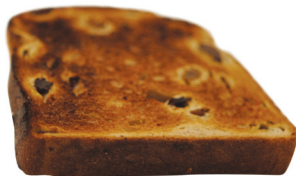
1 slice (30 g) raisin bread