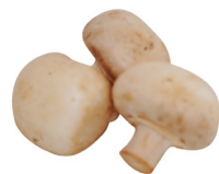
Mushrooms, 60 g