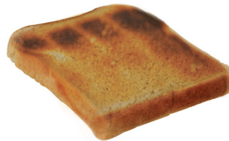
Stoneground wholemeal or sourdough rye