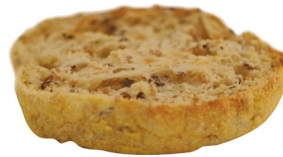
½ wholegrain or fruit English muffin