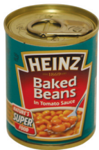
130 g baked beans