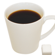
Tea/coffee, black/white with milk or 1 sugar