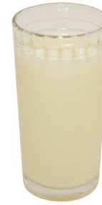
Skim milk, 200 ml