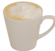
1 hot skim milk drink, 200 ml