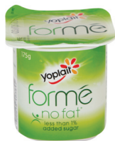
Yoplait Forme, 175 g